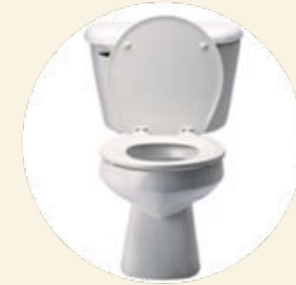
Near future: struvite / meat-bone meal ?